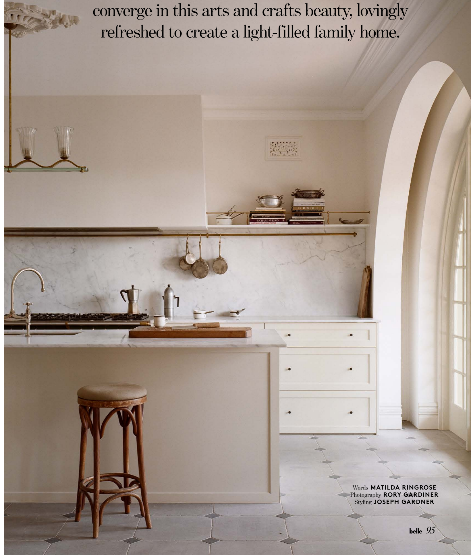
This page In the ground floor sitting room, a 'Le Bambole' two-seater sofa by Mario Bellini for B&B Italia with original mustard canvas from 506070, a Luiz Lafer Brazilian rosewood armchair Vampt Vintage Design and 'PK61' coffee table from The Finery Company sit on a Persian Mazandaran flatweave rug from Cadrys. Floor lamp from VBO. Plaster shell plafoniere chandelier in the style of Jean Charles Moreux from The Vault Sydney. Opposite page Tumbled Italian cabochon Grigio marble tiles with Nero diamond accents were used throughout the kitchen, dining and open-plan living areas on the lower-ground floor. A Carrara marble benchtop and splashback from Nefiko Marble is complemented by custom hand-painted joinery, rangehood and mottled brass rails, all designed by AP Design House. Sully 'Classic' Lacanche cooker in Racing Green with stainless-steel and brass hardware. Italian four-shade pendant light from Nicholas & Alistair. Perrin & Rowe 'Ionian' bench-mounted kitchen mixer in Polished Nickel from The English Tapware Company. Vintage Thonet bar stool upholstered in 'Candela' linen from Alhambra Fabrics. Ceiling rosette and cornice by Unique Plaster.

A romantic palette of soft, creamy neutrals converge in this arts and crafts beauty, lovingly refreshed to create a light-filled family home.