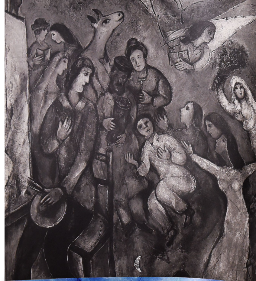
I'm Going To Miss You, (2021)

ng of Songs I have scolded me for putting poetry into my true, something else is asked of the pictorial art, me a single great work that does not have its poetry! Which is not to say that I believe in ion, in an explosion dictating the work. It is my life that is identified with my work, and it seems to t I'm the same when I sleep. Others, on the other are amazed that during my summer holidays I take ure in painting flowers or landscapes. The need to sify obliges them to suppose that I am, by turns, a list or a poet! As a man, haven't I still the right to set on the place where I've lived for a while? In no way can allow myself to be committed to a system, to any sort of ategory. And I've often dreamt of that fine day when I'll be able to isolate myself completely, as the monks once did in their monasteries.